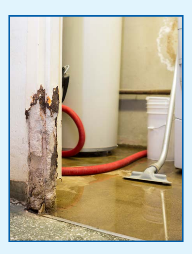
Reduces the risk of sewer backups into homes and businesses