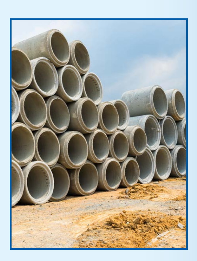
Reduces community investments and sewer fees for larger sewer pipes and facilities